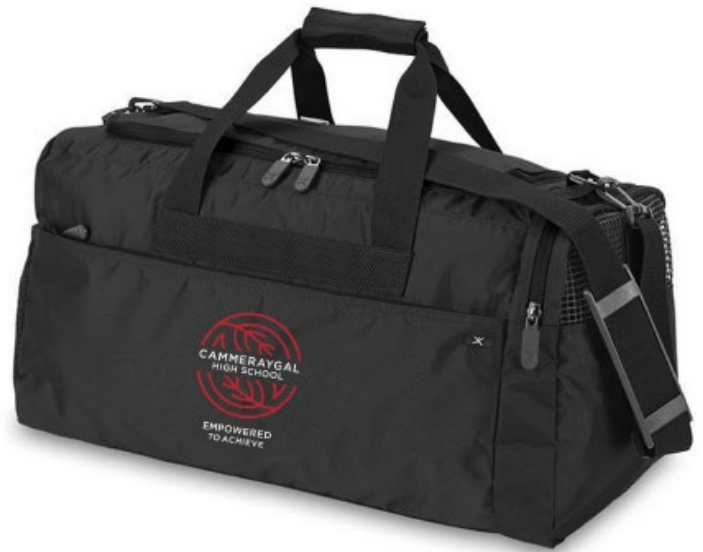
Olympic Sports Bag $ 45.00

Please be advised that the Olympic Sports Bag is not to be used as the everyday school bag. These items will also be available to purchase on the Cammeraygal web store in the near future.