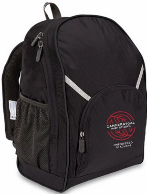
Unpack Back-Pack $ 55.95