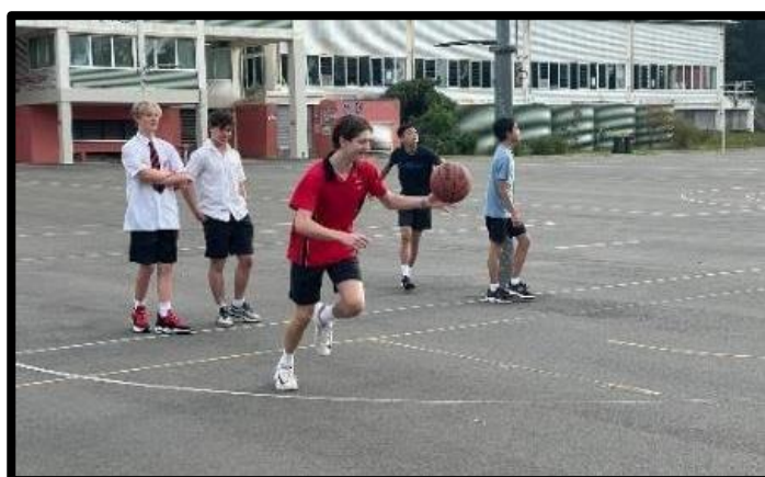
Members of the Panthers and Lions enjoying the warmup drills at training.