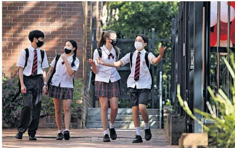
Cammeraygal students catch up yesterday.

The NSW Education Standards Authority, which runs the HSC, will extend its special consideration program to any student whose learning was significantly compromised for six weeks or more due to restrictions. In Sydney's 12